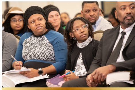
RICHMOND , VA